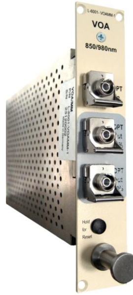
Variable Optical Attenuator Module L-6001-VOAxx-1

The VOAxx-1 is a Variable Optical Attenuator module that plugs in to the XBERT and ParalleX™ Chassis. Versions for single mode (VOASx-1) and multimode (VOAMx-1) use are available, covering wavelength ranges of 1270-1350nm/1510-1590nm (SM), and 800-1000nm (MM). The module also incorporates a coupler with monitor output, allowing for simultaneous measurement of optical power. When used in the XBERT chassis with EBERT , Clock, XFP and power meter modules, users can perform receiver sensitivity tests with one instrument.