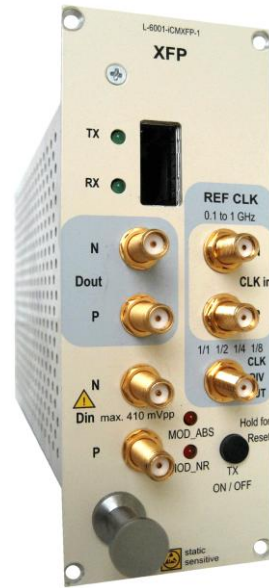
XFP CONVERTER MODULE PN L-6001-ICMXFP-1

iCMXFP-1 is an XFP O/E, E/O converter module that plugs into the XBERT and ParalleX™ chassis. iCMXFP-1 incorporates a standard XFP module slot, which gives the user great flexibility to provide & plug-in an XFP module which meets their testing requirements. All MSA voltages are supported for XFP modules to 3.5W. Monitor and control functions can be changed via an easy to use GUI, including serial bus access of the XFP module. An identical module in terms of performance is the eCMXFP. This external module can be connected via cable to the X-BERT mainframe, and is very useful for device testing during temperature cycling or burn-in, due to the relaxed cable length requirement between the converter module and DUT.