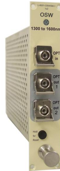
OPTICAL SWITCH MODULE PN L-6001-OSWxM