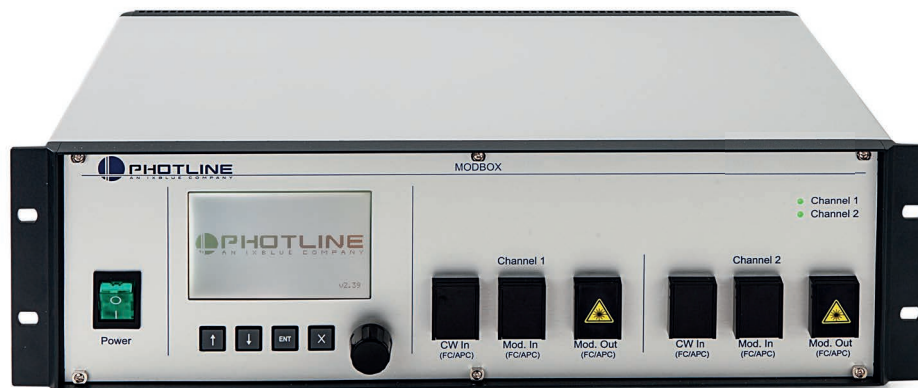
Two channels ModBox - VNA example - Front